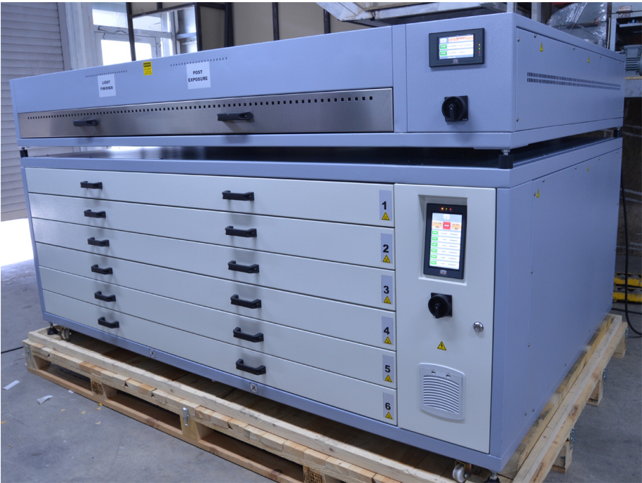
REVVIS PRO-IV - Dryer with Light-Finisher

Maximum Plate Size: 1320X2032 mm Power Supply: 400V AC 3Phase N-PE