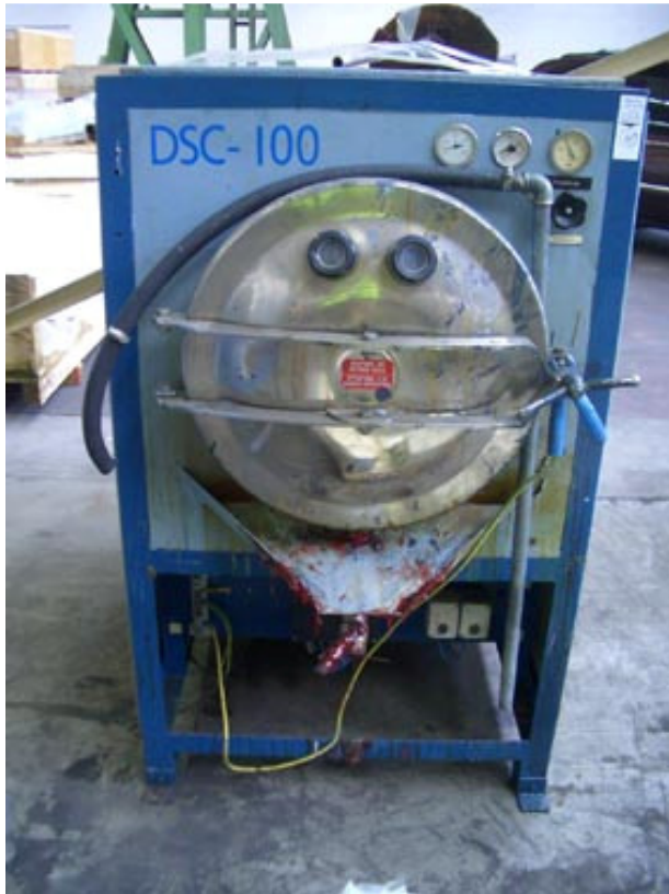
DSC 100 in our warehouse