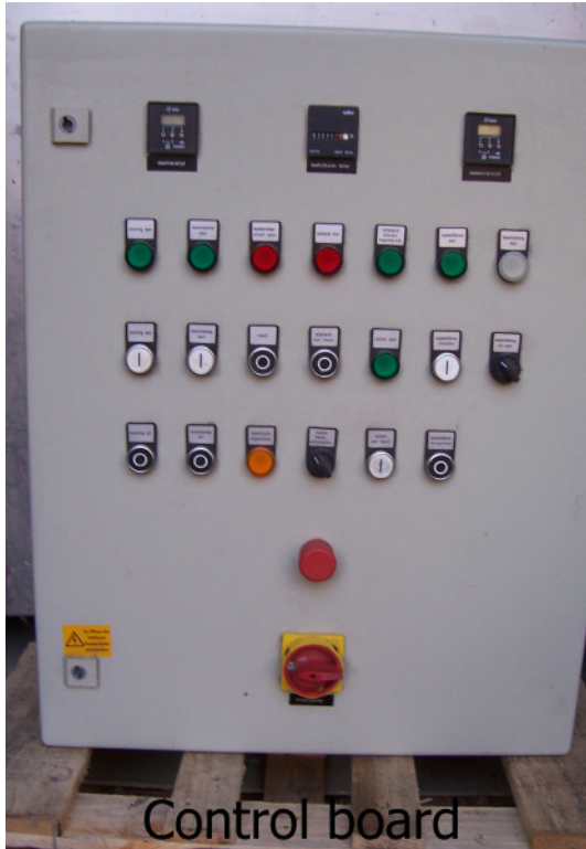
Control board with working hour meter